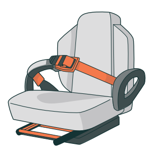
FIGURE 2: Semi-rigid buckle