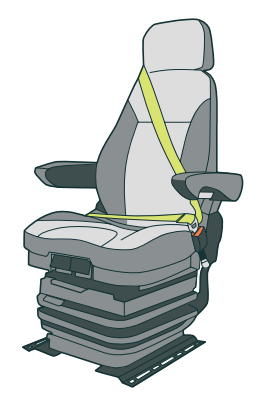
FIGURE 3: Integrated seatbelt